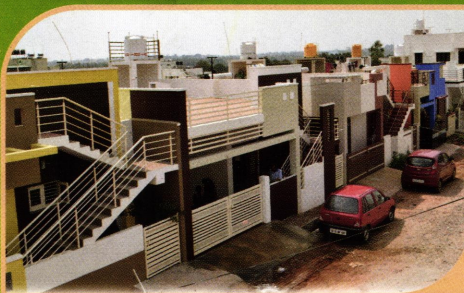
MMG Prama Enclave, Srirampura 12 Individual Houses