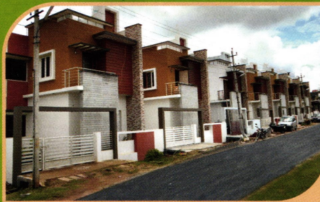
MMG Aishwarya Royal, Bogadi 80 Individual & Row Houses