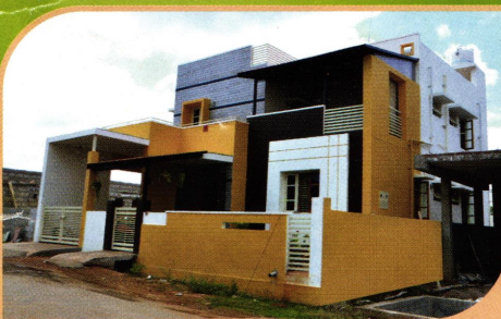
MMG Temple Bells, Srirampura 80 Individual & Row Houses