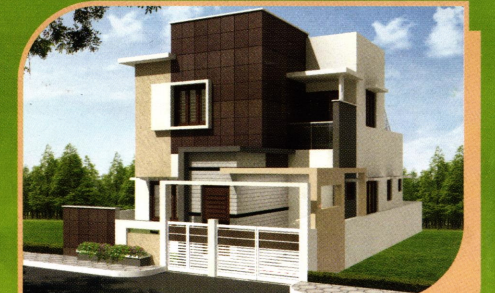
MMG SS Gardenia, Bogadi 50 Individual Houses