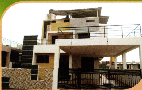
MMG Yeshwini Residency, Bogadi 35 Individual Houses