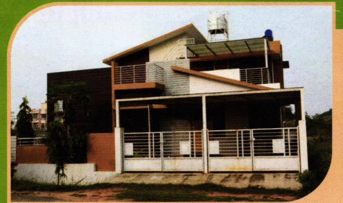
MMG Century, Hootagally 100 Individual & Row Houses